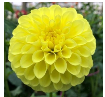
Blyton Golden Girl - Small Decorative