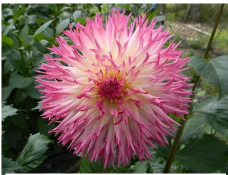
Glenmarc Philly Liz - Fimbriated