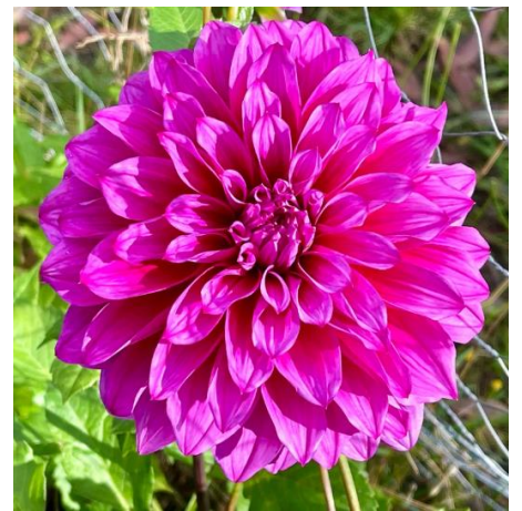
Blue Edge - Medium Decorative