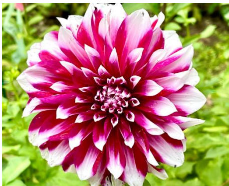
Helena - Medium Decorative