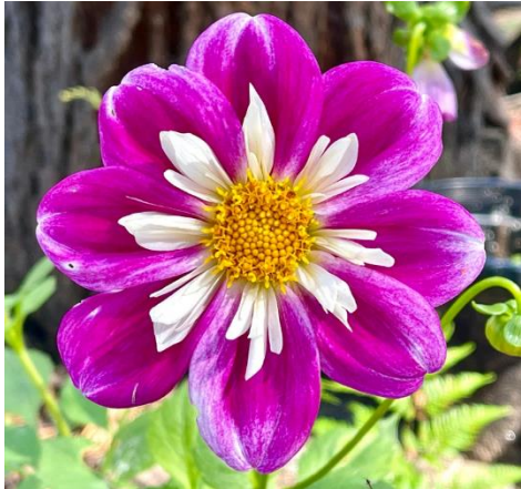
Aegean Sky - Collarette