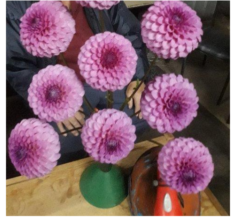
Glenmarc Connie - Small Decorative