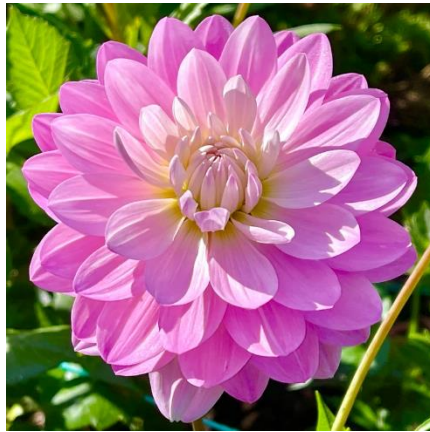
Figurine - Waterlily