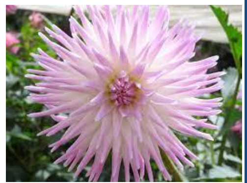
Gay Twinkle - Small Cactus