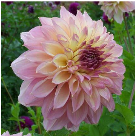
Kotara - Medium Decorative