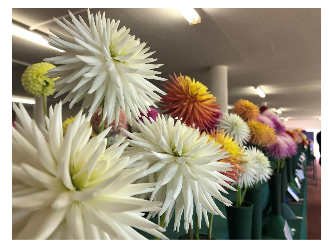
Mighty Cheap turned out to be a prime location to attached members of the public to come along and participate in our 53^{\circ d} annual show.